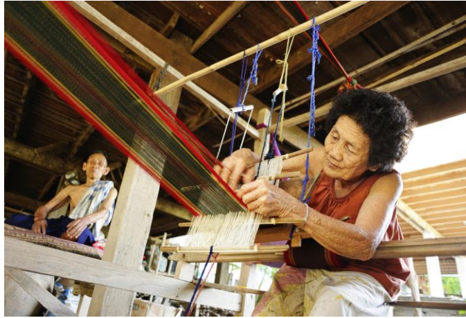
Ban Hat Siew in Sukhothai province, Northern Thailand: a Tai Phuan woman meticulously patterning a “Pha Sinh Teen Chok,” a kind of sarong for ceremonial use.