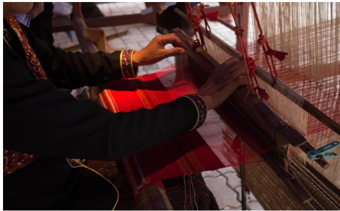
Ban Phon in Kalasin province, Northeastern Thailand: a Phu Tai woman weaving Phrae Wa silk in Kalasin.

The making of artisanal Thai fabrics is also closely associated with nature. For silks, villagers grow mulberry trees and harvest the leaves for feeding silkworms. Leftover waste from growing the silkworms then becomes good quality fertilizer. In contrast to chemical dyes, colors derived from natural sources such as indigo for blue, ebony seeds for grey and black, lac for red, are non-toxic, so they can be discarded without causing harmful pollution. Old traditional techniques therefore, continue to prove better for both the planet and the people.