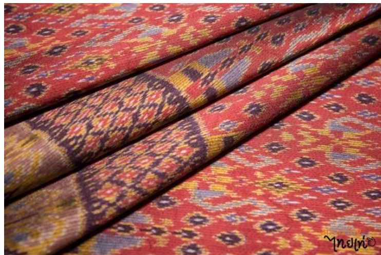
Examples of local mudmee from Baan Hua Fai Village.

Over the years, Baan Hua Fai has grown to be a village cooperative of almost 200 members, most of them women. Today, it has become a model OTOP enterprise that welcomes visitors and serves as a learning and collaborative center for design and production techniques. Younger generations are adopting new business models according to changing tastes and the marketing environment. They sell products online via Facebook and Instagram, and collaborate with Thailand's top designers.